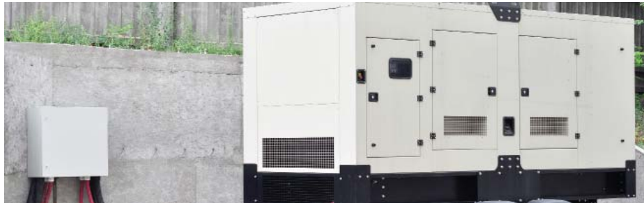
An industrial-scale emergency power generator. The U.S. government's inventory of backup generators is currently sized for conventional disasters and larger events on the scale of Superstorm Sandy, not for Black Sky-level scenarios.

Characterized here as the National Emergency Utility Consumables Council (NEUCC), this effort would be a parallel initiative to NEPC, and would also likely be developed and managed by National Recovery Coordination Framework teams.