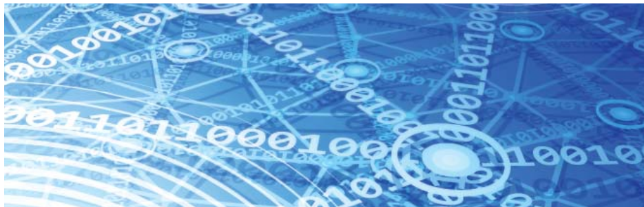
A Black Sky-compatible, software-based National Recovery Coordination System can act as a system model for emergency recovery needs and assets, nationwide, as a vital aid for National Recovery Coordination Framework teams

Functioning as a continuously developing system engineering model of Black Sky emergency support needs and capabilities, an NRCS system will be essential to enable managers to quickly assess and respond to needs, while understanding the consequences of different tradeoff decisions. In the highly disrupted environments associated with these extreme scenarios, this tool will be central to ensuring timely, well-prioritized decisions that respond to rapidly fluctuating situational awareness elements across the many affected regions anticipated for these severe hazards.